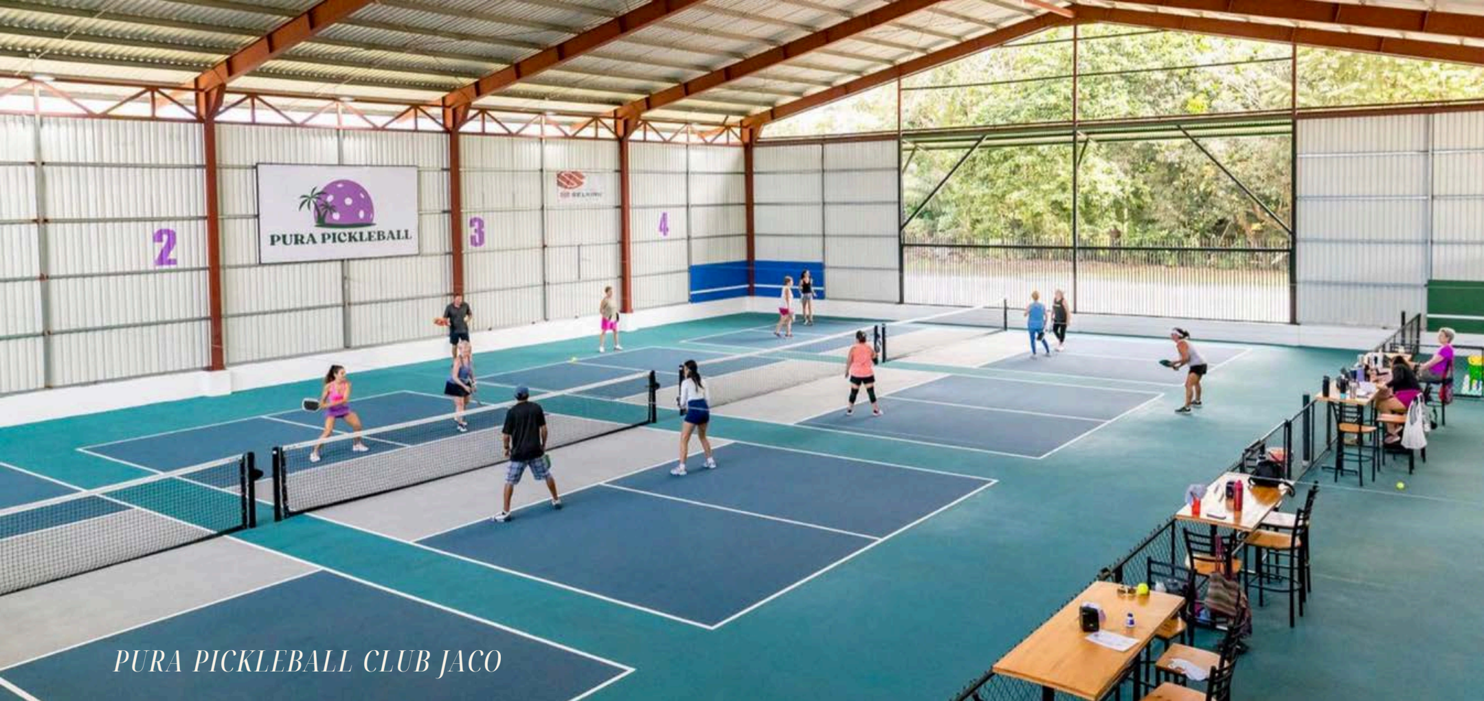
PURA PICKLEBALL CLUB JACO

A UNIQUE PICKLEBALL ADVENTURE WITH 4 NIGHTS OF BEACH FUN FOLLOWED BY 4 NIGHTS OF JUNGLE BEAUTY. IT'S A CAREFULLY CURATED JOURNEY THROUGH COSTA RICA'S MOST BEAUTIFUL REGIONS, COMBINING PROFESSIONAL COACHING WITH UNFORGETTABLE ADVENTURES.